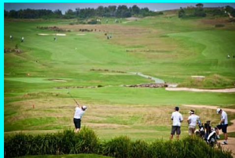
Picturesque Long Reef