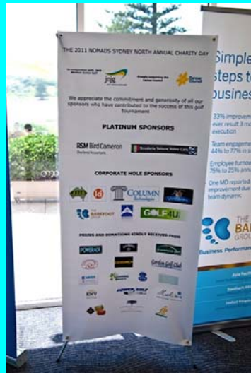
Thank you to all our Sponsors