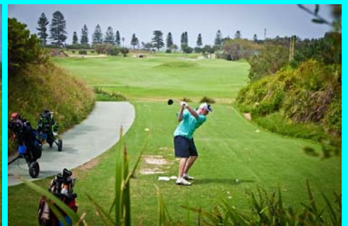
Teeing off on the 4 th