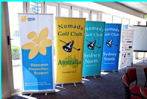
Cancer Council leading the way