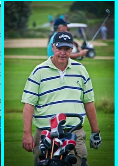
Can I use another club for the Mulligan?