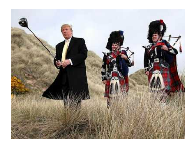
"Yes", is the answer to your question: "Can Donald Trump play golf?" He plays regularly off a 3....

As you might expect, playing a round of golf on the weekend costs a pretty penny - up to $375!