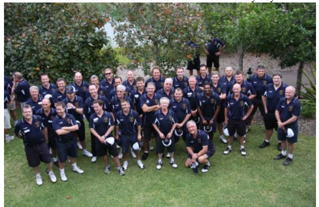
Sydney North Contingent