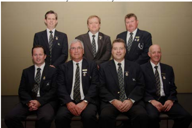
2012 Tournament Organising Committee