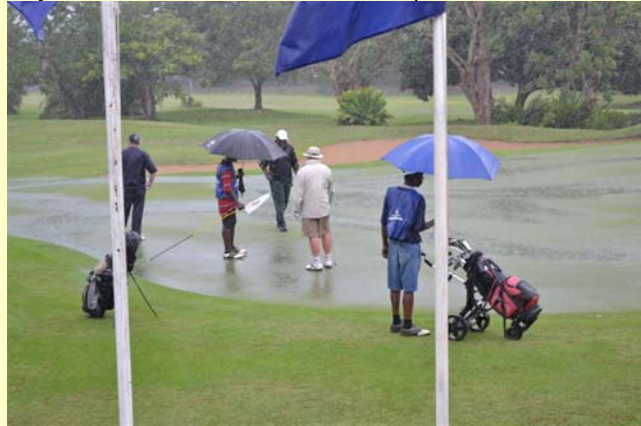
Rain washes out the opening day's competition