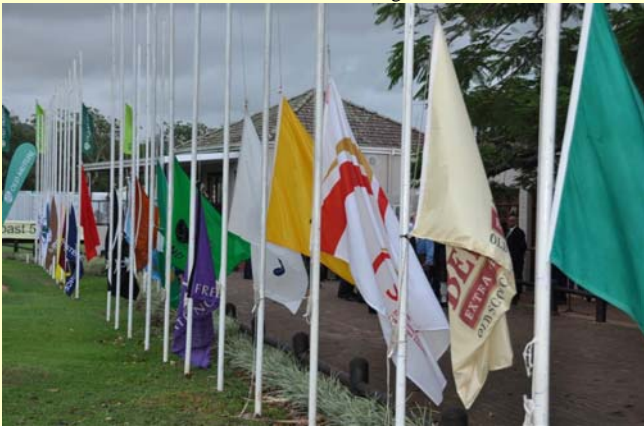
Flag raising on eve of tournament