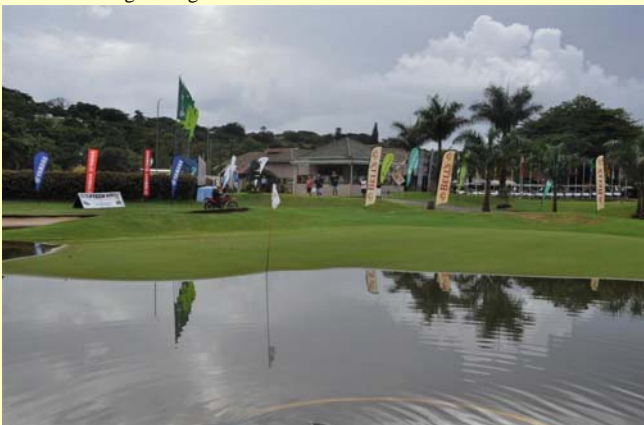
9th green on Monday – again no play