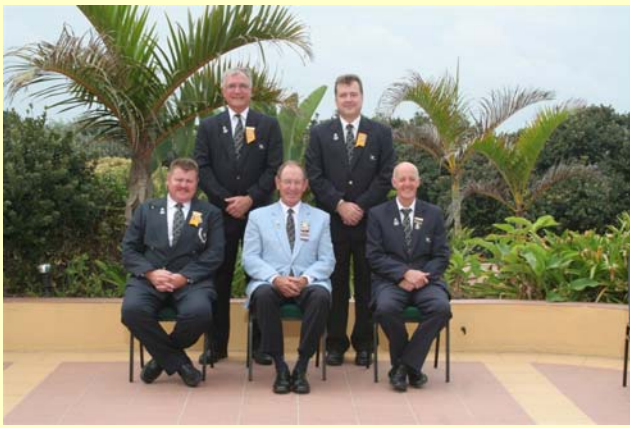
Australians at Council Meeting